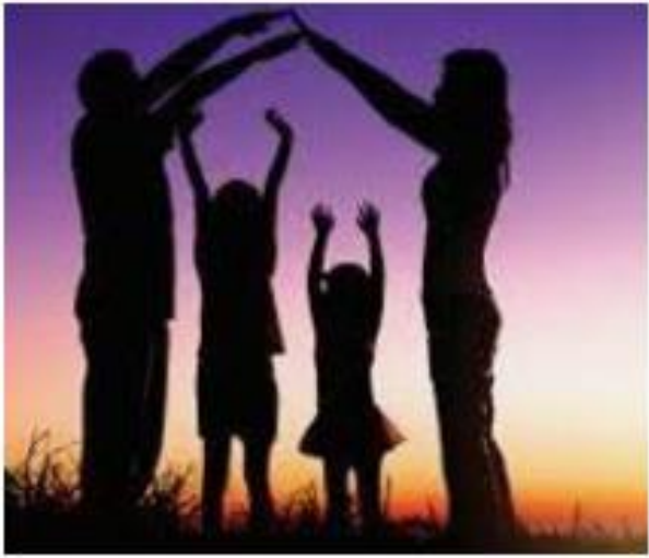
Theme A: Relationships and Families