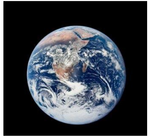
Theme B: Religion and Life