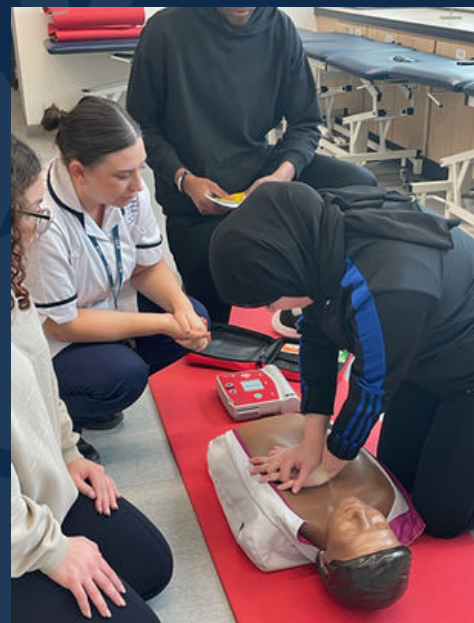
Year 12 students learning CPR and how to use a Defibrillator to restart the heart.

"They also got to take part in some activities with special glasses that distorts vision and then, the students favourite, learning how to test reflexes at the knee and elbow! A great eye opener into the different courses available in medicine and health care."